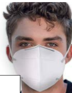
External Nose Clip on cloth