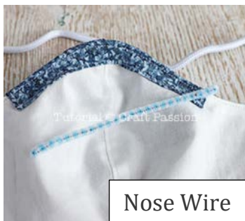
Nose Wire Pocket - inside

Some parents recommend selecting face coverings for children that do not have a nose clip, as children were observed to complain less about comfort when the nose clip was gone.