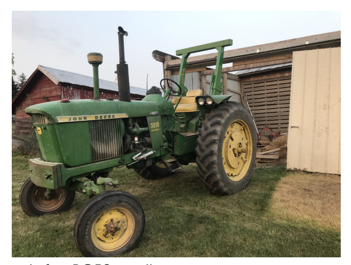
John Deere 3010 Diesel before and after ROPS installation

The farmers who have taken advantage of this funding so far are a diverse group that includes crop, livestock, and produce growers. Sixty-five percent report being part-time farmers and farm sizes range from 20 to 1600 acres. Of the livestock farmers, most report having cattle, along with a couple of goat and sheep farmers; herd sizes range from 2 to 200 head. Most farms have more than one tractor, and two farms have 12. In addition, 15 already have at least one tractor with ROPS, and six of those have previously retrofitted another tractor. Finally, five farmers report having experienced a serious incident on their tractor, and 75% report that they will always use the seatbelt when operating the retrofitted tractor.