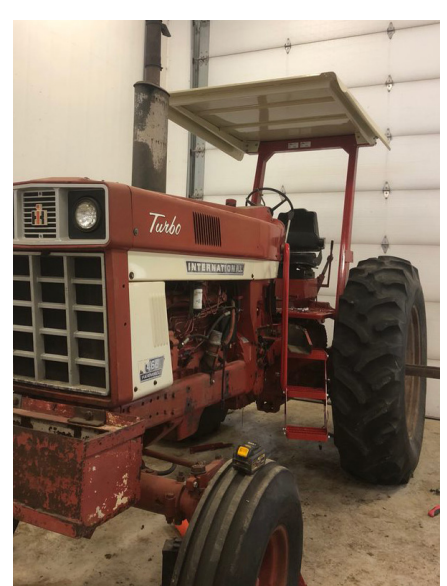
International 1466 before and after ROPS installation.

their own funds to retrofit, had sold the tractor, or no longer needed the funding for other reasons. Since we began, I-CASH has invested over $30,000 in 27 counties to retrofit 32 tractors from the original waitlist with this lifesaving technology.