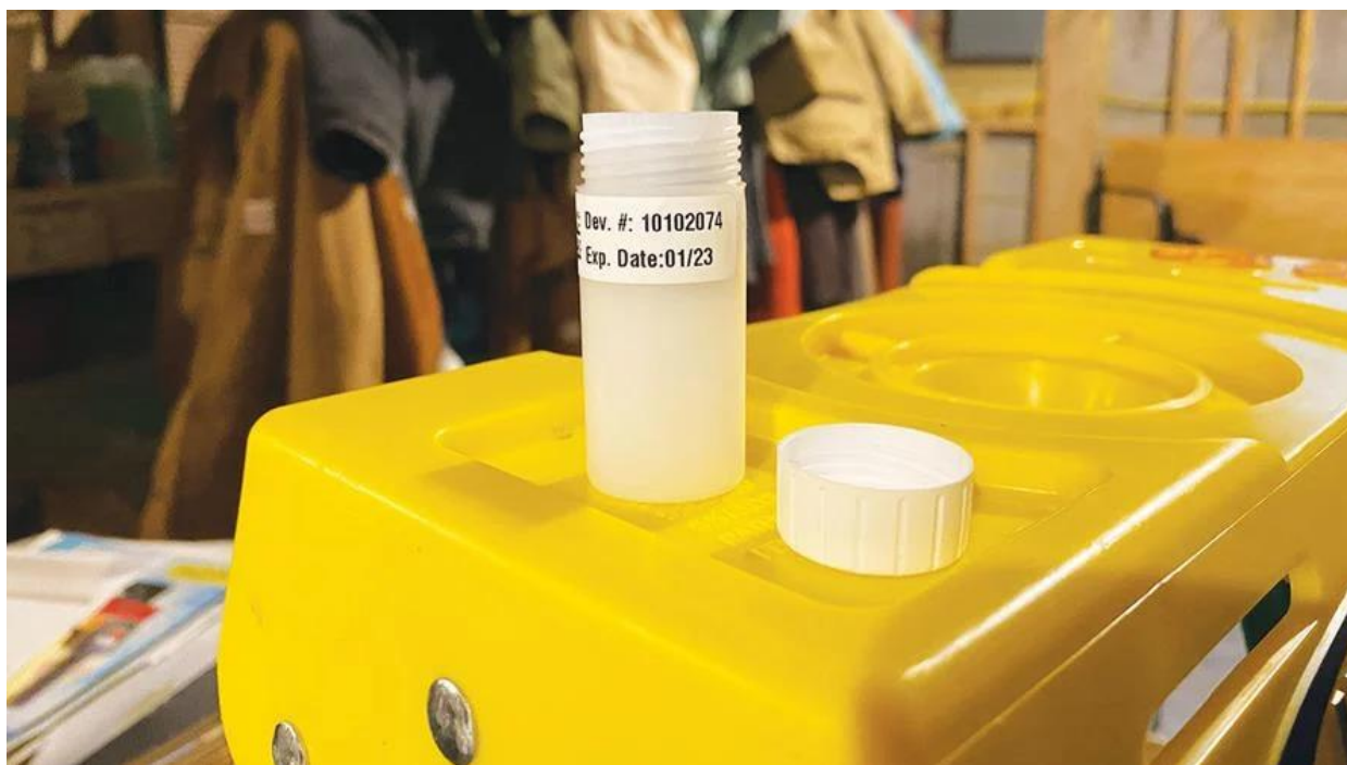
Photo of the short-term radon test kit set up in the basement.