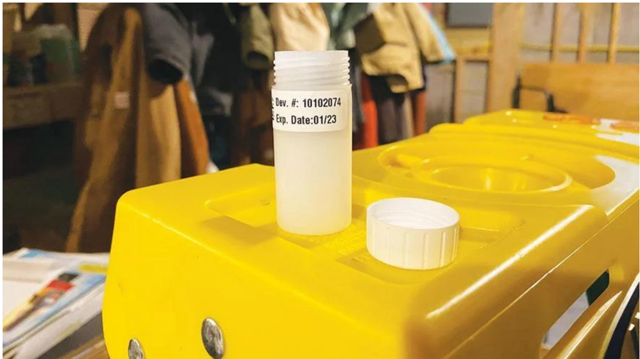
Photo of the short-term radon test kit set up in the basement.